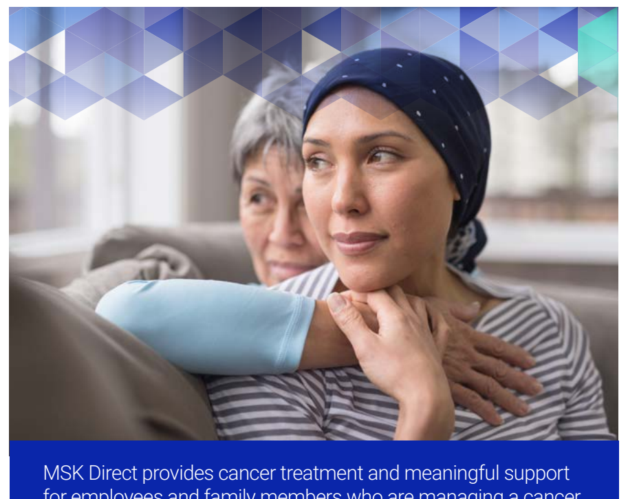
for employees and family members who are managing a cancer diagnosis or treatment.

Eligibility is automatic and there is no additional charge to use the MSK Direct guided access program regardless of your medical plan enrollment with MSCI or if you are enrolled in a spouse's plan. However, you are still responsible for standard out-of-pocket costs (i.e. copays, deductibles and coinsurance) based on your health plan enrollment. You should contact your health plan to determine your coverage for care at MSK.